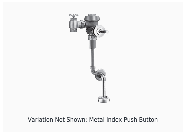
Variation Not Shown: Metal Index Push Button